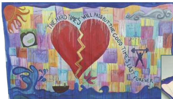
This mural was a joint project created by 37 children who attended Camp Kangaroo at Shake-A-Leg in Miami, Florida.