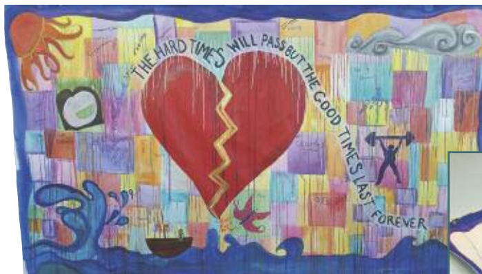
This mural was a joint project created by 37 children who attended Camp Kangaroo at Shake-A-Leg in Miami, Florida.